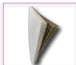
trurock hd comes with continuous fibreglass mesh embedded in the high density core